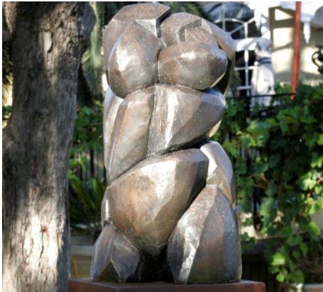
Clara Hali, blackheath woman , Sculpture by the Sea , Cottesloe 2010.

Bronze: an alloy of copper, tin and brass. An alloy is a mixture of metals in specific ratios that when combined produce a stronger, harder and more durable metal. Bronze is widely used as a casting material for sculpture. See casting .