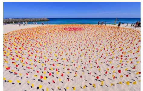
Carl Billingsley, red center , Sculpture by the Sea , Cottesloe 2013.

Multiples: a series of identical objects produced (or selected found objects) by the artist and arranged according to their idea.