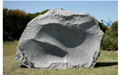
May Barrie, time and tide , Sculpture by the Sea , Bondi 2009.

Stone: any type of cut rock suitable for carving and building. Types of stone include granite, marble, sandstone and may be carved, polished or drilled.