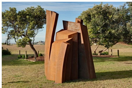
Linda Bowden, into the trees II , Sculpture by the Sea , Bondi 2010.

Oxy cutting: the process of using a blow torch to cut through metal. The heat energy and high temperatures needed to melt the metal, and therefore 'cut' through, is provided by the combustion of fuel and oxygen in a torch, hence the name 'oxy cutting'.