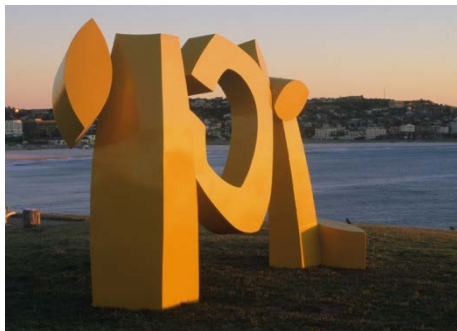
Philip Spelman, ylang-ylang , Sculpture by the Sea , Bondi 2003.

Abstract: not representational or concerned with depicting something actual or easily recognisable. The use of basic elements seen in an object and rearranged /reassembled to create another shape or pattern which may or may not suggest a theme or subject matter. The use of shapes and colour to express an emotion or idea.