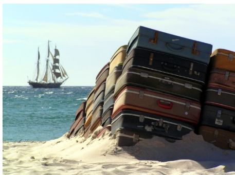
Nien Schwarz, transpose transpose , Sculpture by the Sea , Cottesloe 2005.

Readymade: an everyday object that has been removed from performing its intended function and placed into an art context.