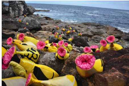
Margarita Sampson, the yearning , Sculpture by the Sea , Bondi 2011.

Soft Sculpture: sculptures that use unconventional, everyday, 'soft' materials to challenge sculptural conventions such as weight, strength, mass and scale.