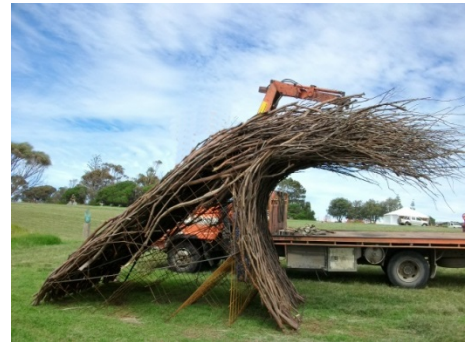
Peter Collins, tide's turn (installation photo), Sculpture by the Sea , Bondi 2010.

Armature: a rigid framework made of wood, metal or piping that is used to support wet or soft sculptural materials during the construction of a sculpture.