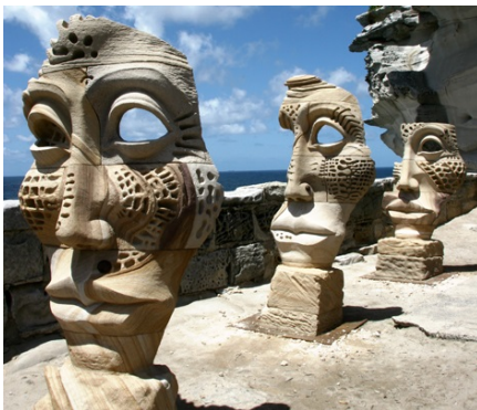
Michael Purdy, time and space (facial deconstruction) , Sculpture by the Sea , Bondi 2005.

Carving: the process of cutting away from a material to produce a desired form. Artists may use hand and electric tools, such as drills, hammers, chisels and knives to cut away from hard materials such as stone, cement, clay, plaster and ice. Once the material has been carved away it cannot be replaced so the carving process is often slower to avoid unnecessary mistakes.