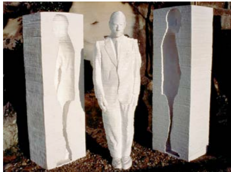
Richie Kuhnaupt, hollow man , Sculpture by the Sea , Bondi 2000.

Mould: a hollow container, usually made of plaster or rubber, which is used during the casting process to hold liquid materials before they set. The shape of the mould determines the shape of the resulting sculpture.