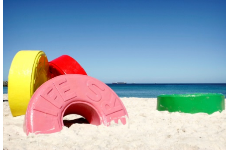
Denise Pepper & Brooke Zeligman, lifesavers , Sculpture by the Sea , Cottesloe 2009.

Casting: a process that produces a positive form (cast) by pouring liquid materials into a mould and allowing them to set.