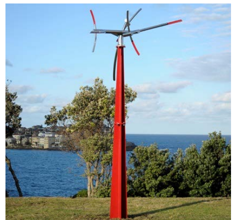
Hiroyuki Kita, wind for tomorrow , Sculpture by the Sea , Bondi 2010.

Kinetic: an artwork that involves or relies upon movement to communicate its intended purpose. This movement may be powered by natural processes (wind), manufactured processes (mechanic or electrical) or through audience intervention (due to the sculpture's structural tension).