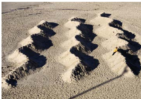
Lorna Green, wave , Sculpture by the Sea , Bondi 1998.

Environmental: artworks that use materials or ideas that reference the land, environment, and the natural world.