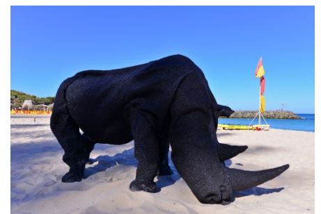
Mikaela Castledine, gift of the rhinoceros , Sculpture by the Sea , Cottesloe 2013.

Crochet: a traditional craft technique, similar to knitting, where a hook is used to pull loops of a given material through other loops to create shapes/patterns. The crochet designs can be sewn or connected together.