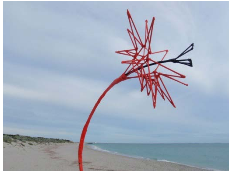
Melanie Maclou, entomophily (maquette), Sculpture by the Sea , Cottesloe 2012.

Maquette: a preliminary, small-scale three-dimensional model of an intended or final large sculptural artwork.