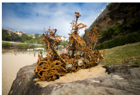
Cactus Jack Garner, l'astrolabe wrecked , Sculpture by the Sea , Bondi 2007.

Assemblage: the technique of joining individual objects or segments that are natural, manufactured or found to produce a larger sculptural work. This technique may incorporate a variety of processes, such as welding, gluing and riveting, depending on the materials used to create the sculpture.