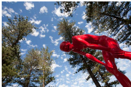
Chen Wenling, red memory smile , Sculpture by the Sea , Cottesloe 2011.

Figurative: representational, that is, representing something real or recognisable in a straightforward manner, generally the human form.