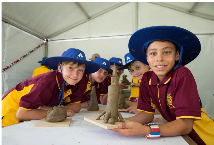
Sculpture by the Sea, Cottesloe 2019.