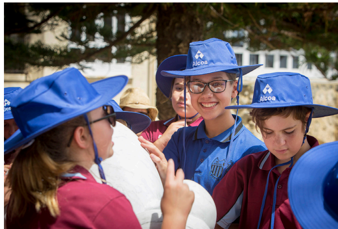
Sculpture by the Sea, Cottesloe 2019.