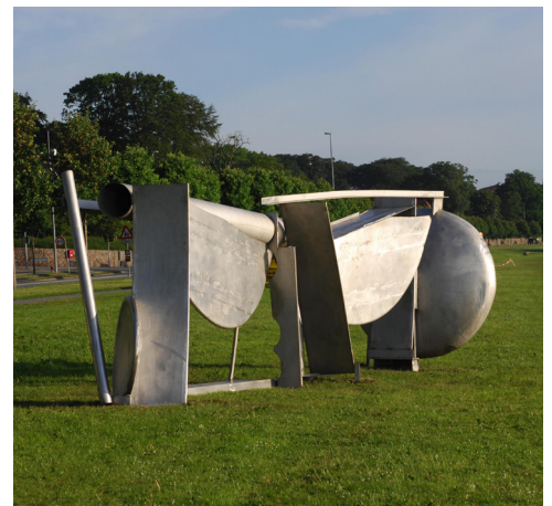
Sir Anthony Caro OM, 'Sister ships', Sculpture by the Sea, Aarhus 2009.