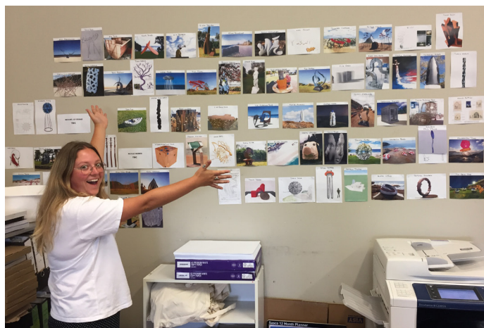
Image of all the sculptures for exhibition on display in the Sculpture by the Sea Office, January 2019.

While the artists are busy making their sculpture, the Sculpture by the Sea Team is working hard to make sure that everything is ready for the opening day.