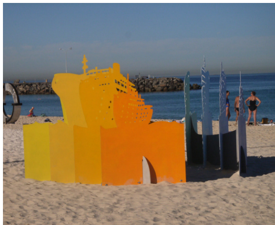
George Haynes, 'Sister ships', Sculpture by the Sea, Cottesloe 2006.