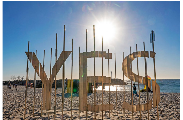
Sachio Ingrassia, 'Perspective' Sculpture by the Sea , Cottesloe 2022.