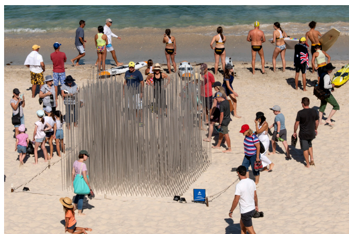
Miik Green, 'Thicket 018', Sculpture by the Sea, Cottesloe 2019.

Installing the exhibition takes a week, which is an incredibly short amount of time. In one week everything is in place: the sculptures, our temporary buildings and 'Sculpture Inside' exhibition. Once we open Site Crew are responsible for running the site, and begin to prepare planning for the de-install process. Everything that came in must go out and we mustn't leave a trace behind or in anyway damage the site where a sculpture has been placed.