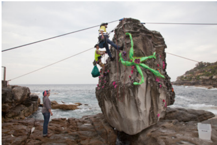
Installation, Sculpture by the Sea, Bondi 2013.

in place; the sculptures along the coastal walk, our temporary buildings, Education marquees and the ' Sculpture Inside ' structure. Everything is checked in accordance with our risk management plan and authorised by Waverly Council. Once the exhibition is open, Site Crew are responsible for running the site and looking after the sculptures, and Education are working with artists, artist educators and the 2,400, or more, students who will participate in the Education Program. Sculpture by the Sea Photographers are busy documenting the exhibition and artworks and together with Media and Design contribute to promoting the event and involving and informing the public through social media and our website.