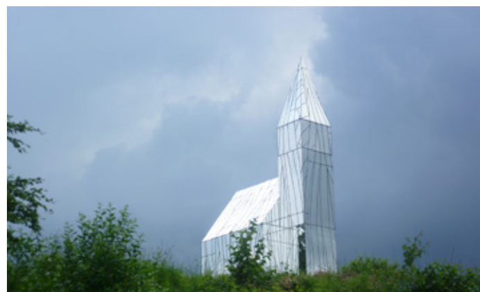
Kent Karlsson, spectacle agnostico , Sculpture by the Sea, Aarhus 2011.