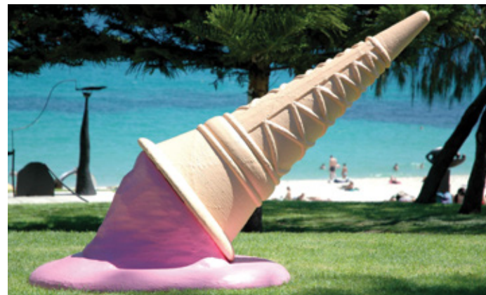
Stuart Clipston, going, going ... gone! , Sculpture by the Sea, Cottesloe 2006.