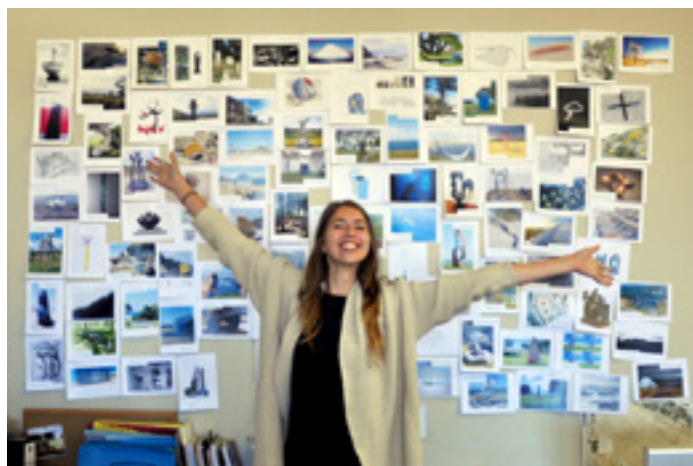
Image of all the sculptures for the 2013 exhibition on display in the Sculpture by the Sea Office.

Then it is October and momentum is gathering. The first trucks pull onto site a bit over a week before we open and it is time for Site Crew to install the exhibition's site infrastructure and assist artists with installing their sculptures. In one week everything is