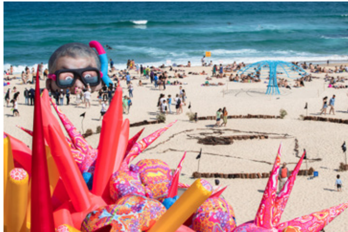
Sculpture by the Sea, Bondi 2018.