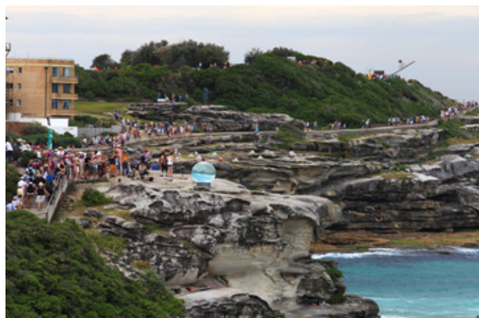
Sculpture by the Sea, Bondi 2013. Photo W Patino