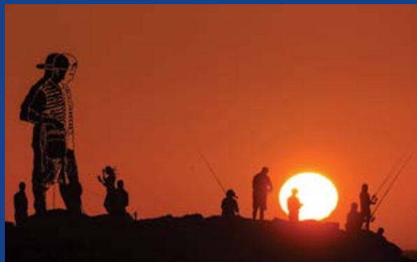
Zadok Ben-David, ‘Big Boy’, Sculpture by the Sea, Cottesloe 2017.