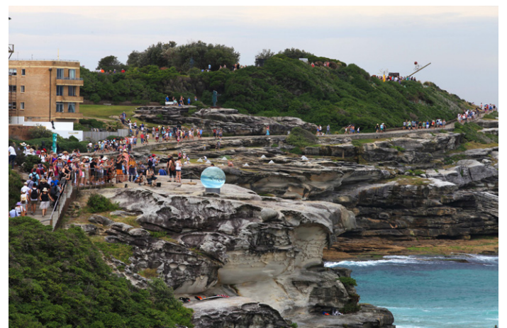
Sculpture by the Sea, Bondi 2013.