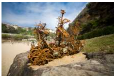
Cactus Jack Garner, l'astrolabe wrecked , Sculpture by the Sea , Bondi 2007.

Assemblage: the technique of joining individual objects or segments that are natural, manufactured or found to produce a larger sculptural work. This technique may incorporate a variety of processes, such as welding, gluing and riveting, depending on the materials used to create the sculpture.