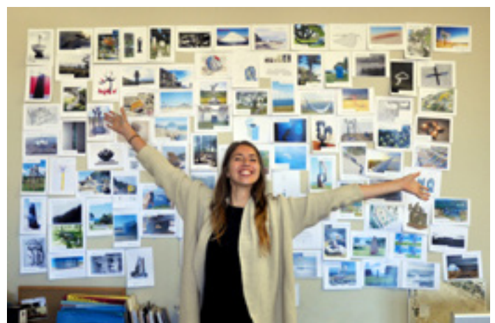
Image of all the sculptures for the 2013 exhibition on display in the Sculpture by the Sea Office.

Then it is October and momentum is gathering. The first trucks pull onto site a bit over a week before we open and it is time for Site Crew to install the exhibition's site infrastructure and assist artists with installing their sculptures. In one week everything is in place; the sculptures along the coastal walk, our temporary