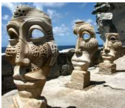
Michael Purdy, time and space (facial deconstruction) , Sculpture by the Sea , Bondi 2005.

Carving: the process of cutting away from a material to produce a desired form. Artists may use hand and electric tools, such as drills, hammers, chisels and knives to cut away from hard materials such as stone, cement, clay, plaster and ice. Once the material has been carved away it cannot be replaced so the carving process is often slower to avoid unnecessary mistakes.