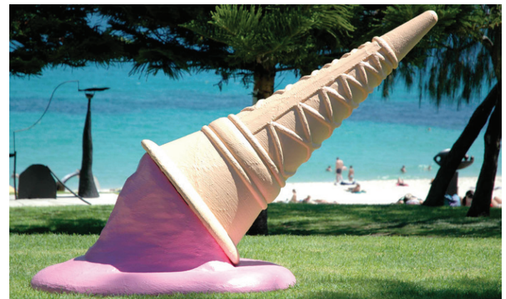
Stuart Clipston, going, going ... gone! , Sculpture by the Sea, Cottesloe 2006.