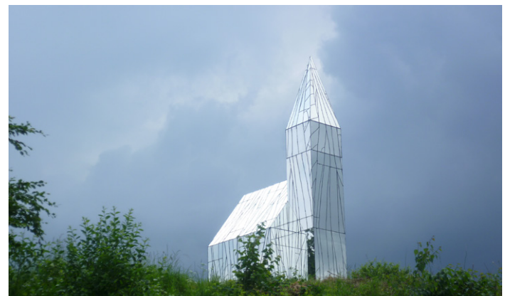
Kent Karlsson, spectacle agnostico , Sculpture by the Sea, Aarhus 2011.