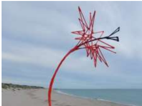
Melanie Maclou, entomophily (maquette), Sculpture by the Sea , Cottesloe 2012.

Maquette: a preliminary, small-scale three-dimensional model of an intended or final large sculptural artwork.