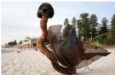
Lou Lambert, red herring , Sculpture by the Sea , Cottesloe 2012.

Assemblage: the combination of natural, manufactured or found materials to create three-dimensional art objects.