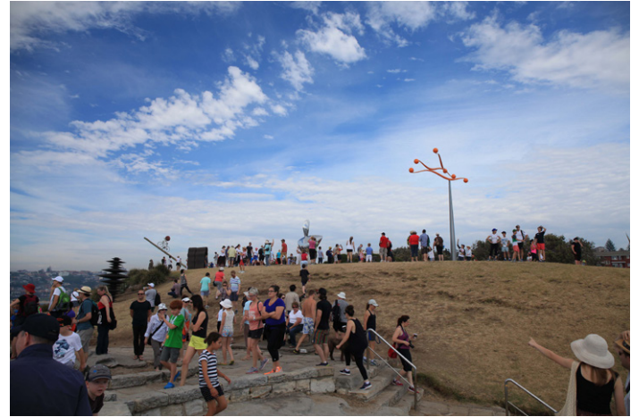
Sculpture by the Sea, Bondi 2013.

buildings, Education marquees and the ' Sculpture Inside ' structure. Everything is checked in accordance with our risk management plan and authorised by Waverly Council. Once the exhibition is open Site Crew are responsible for running the site and looking after the sculptures, and Education are working with artists, artist educators and the 2,400, or more, students who will participate in the Education Program. Sculpture by the Sea Photographers are busy documenting the exhibition and artworks and together with media and Design contribute to promoting the event and involving and informing the public through social media and our website.