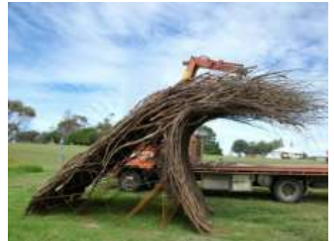
Peter Collins, tide's turn (installation photo), Sculpture by the Sea , Bondi 2010.

Armature: a rigid framework made of wood, metal or piping that is used to support wet or soft sculptural materials during the construction of a sculpture.