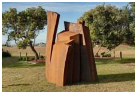
Linda Bowden, into the trees II , Sculpture by the Sea , Bondi 2010.

Oxy cutting: the process of using a blow torch to cut through metal. The heat energy and high temperatures needed to melt the metal, and therefore 'cut' through, is provided by the combustion of fuel and oxygen in a torch, hence the name 'oxy cutting'.