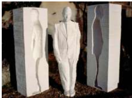
Richie Kuhnaupt, hollow man , Sculpture by the Sea , Bondi 2000.

Mould: a hollow container, usually made of plaster or rubber, which is used during the casting process to hold liquid materials before they set. The shape of the mould determines the shape of the resulting sculpture.