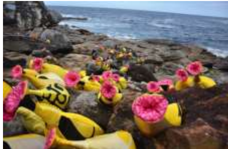
Margarita Sampson, the yearning , Sculpture by the Sea , Bondi 2011.

Soft Sculpture: sculptures that use unconventional, everyday, 'soft' materials to challenge sculptural conventions such as weight, strength, mass and scale.