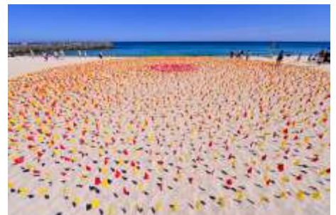
Carl Billingsley, red center , Sculpture by the Sea , Cottesloe 2013.

Multiples: a series of identical objects produced (or selected found objects) by the artist and arranged according to their idea.