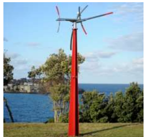
Hiroyuki Kita, wind for tomorrow , Sculpture by the Sea , Bondi 2010.

Kinetic: an artwork that involves or relies upon movement to communicate its intended purpose. This movement may be powered by natural processes (wind), manufactured processes (mechanic or electrical) or through audience intervention (due to the sculpture's structural tension).