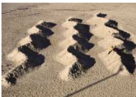
Lorna Green, wave , Sculpture by the Sea , Bondi 1998.

Environmental: artworks that use materials or ideas that reference the land, environment, and the natural world.