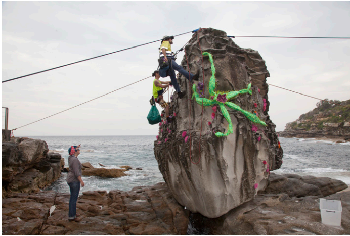
Installation, Sculpture by the Sea, Bondi 2013.