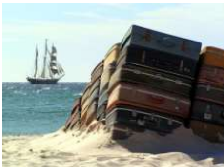
Nien Schwarz, transpose transpose , Sculpture by the Sea , Cottesloe 2005.

Readymade: an everyday object that has been removed from performing its intended function and placed into an art context.